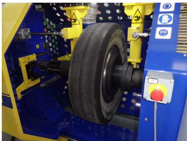
BEAD PLATES ASSEMBLY