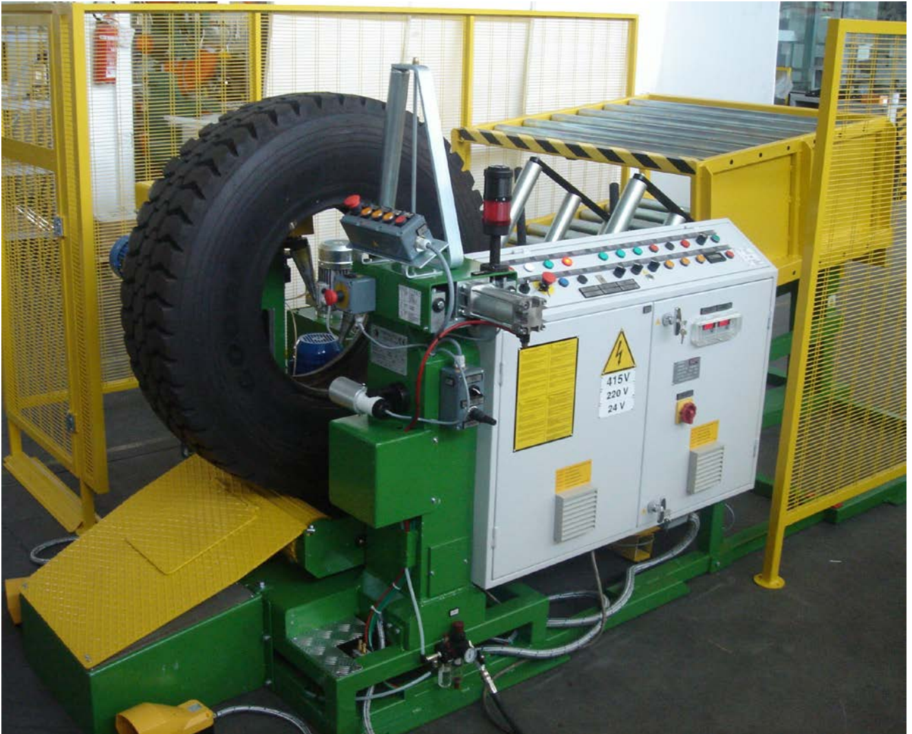
The picture shows the machine complete with HYDRAULIC TILTING TABLE

designed to visually check the internal and external surface of truck tyres