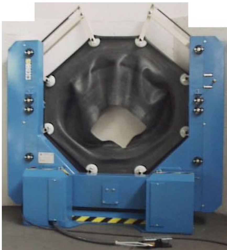
raffigurata con elevatore a pavimento shown with floor lift